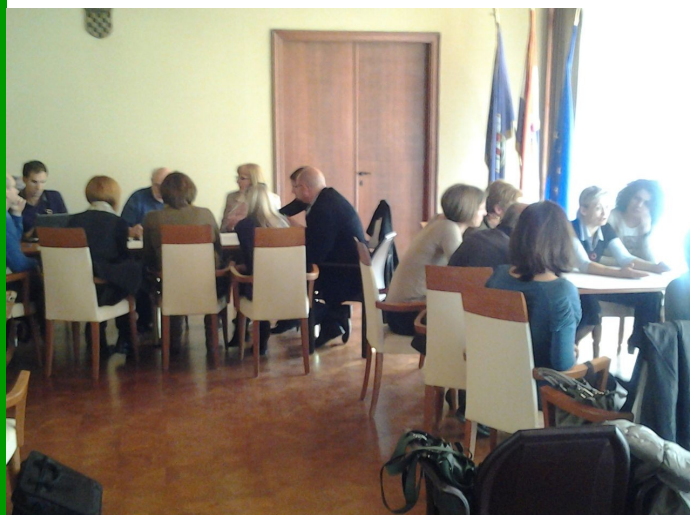
“ Clímagine ” participatory meeting

In addition, the outputs of this assessment will be provided as inputs to a National strategy for adaptation to climate change and a National strategy for regional development.